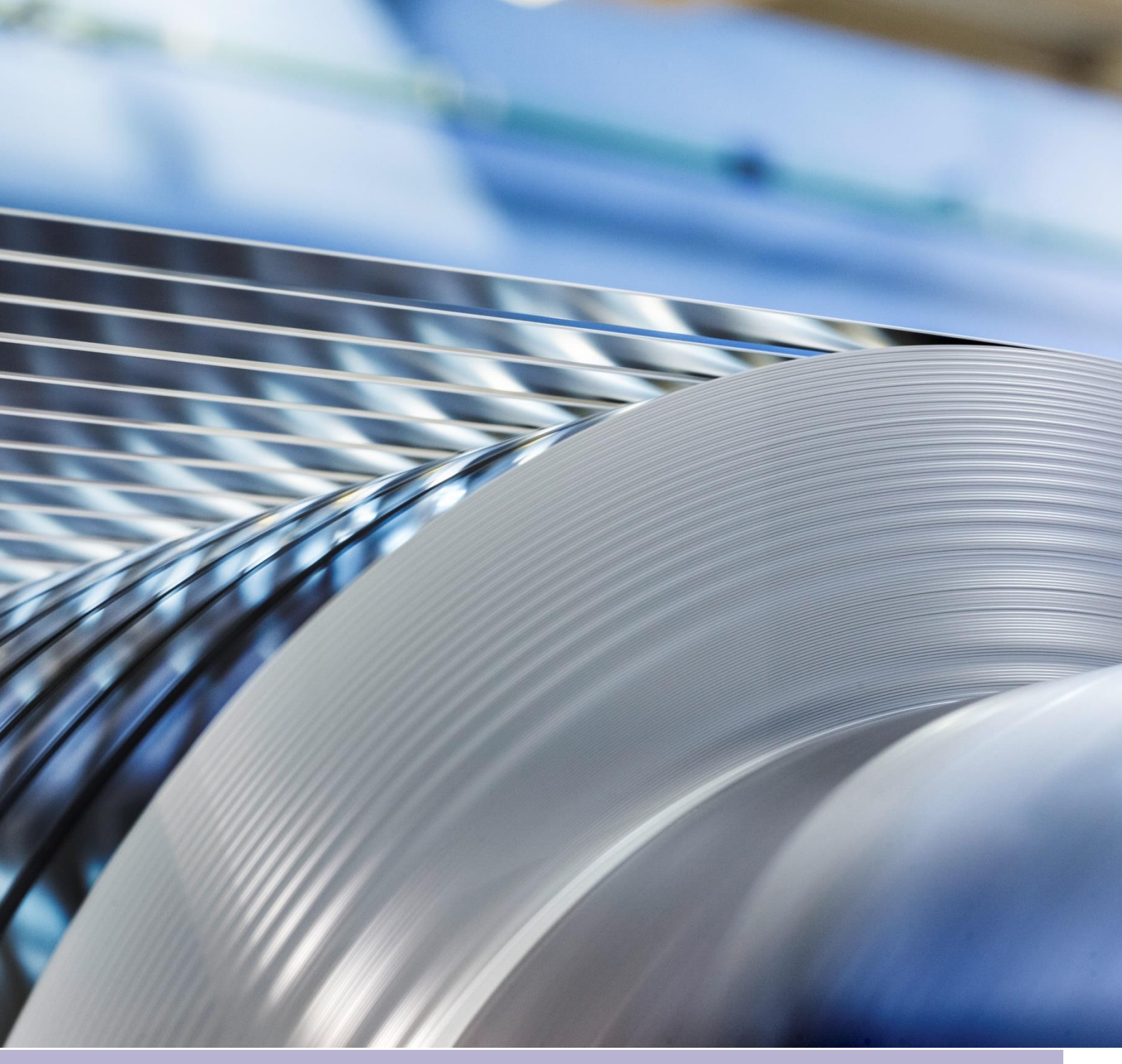
Free translation from the original in Spanish. In the event of discrepancy, the Spanish-language version prevails